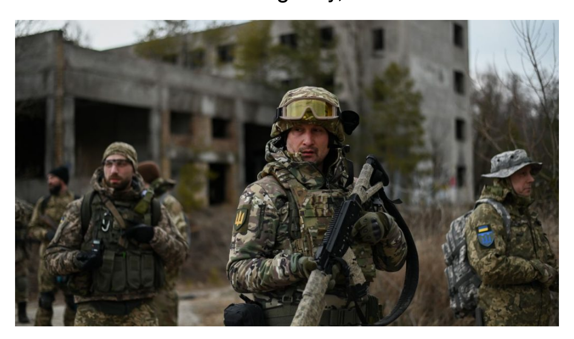
<u>Putin Marches on Ukraine</u> Vladimir Putin's decision for Russia to recognize the so-called Luhansk and