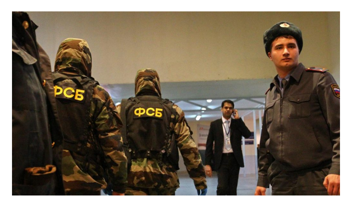
Putin Places Spies Under House Arrest After two weeks of halting war against Ukraine, Vladimir Putin just suddenly launched an attack in a surprising direction — his beloved agency, the FSB