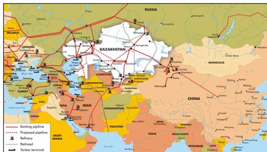
Modern Map of The Great Game

"The Great Game" was a term for the strategic rivalry and conflict between the British Empire and the Russian Empire for supremacy in Central Asia . [1] The classic Great Game period is generally regarded as running approximately from the Russo-Persian Treaty of 1813 to the Anglo-Russian Convention of 1907 . A less intensive phase followed the Bolshevik Revolution of 1917. In the post-Second World War post-colonial period, the term has continued in use to describe the geopolitical machinations of the Great Powers and regional powers as they vie for geopolitical power and influence in the area. [2][3] [8]