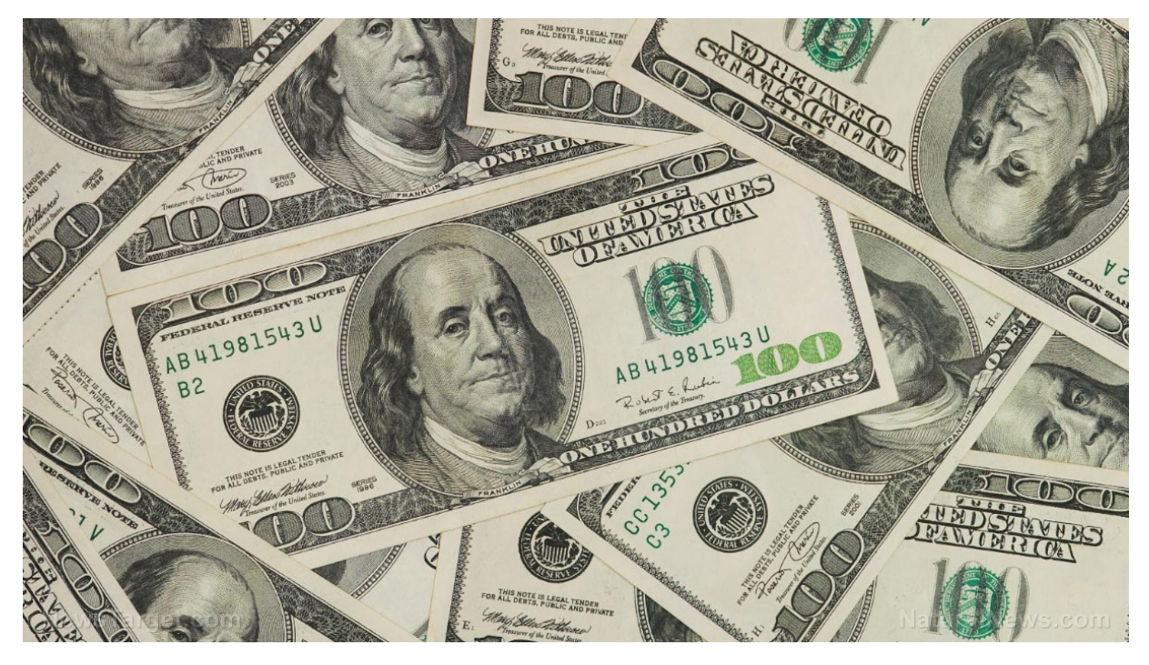
Saudis consider using yuan over dollar in oil sales; move could signal collapse of petrodollar and the American economy