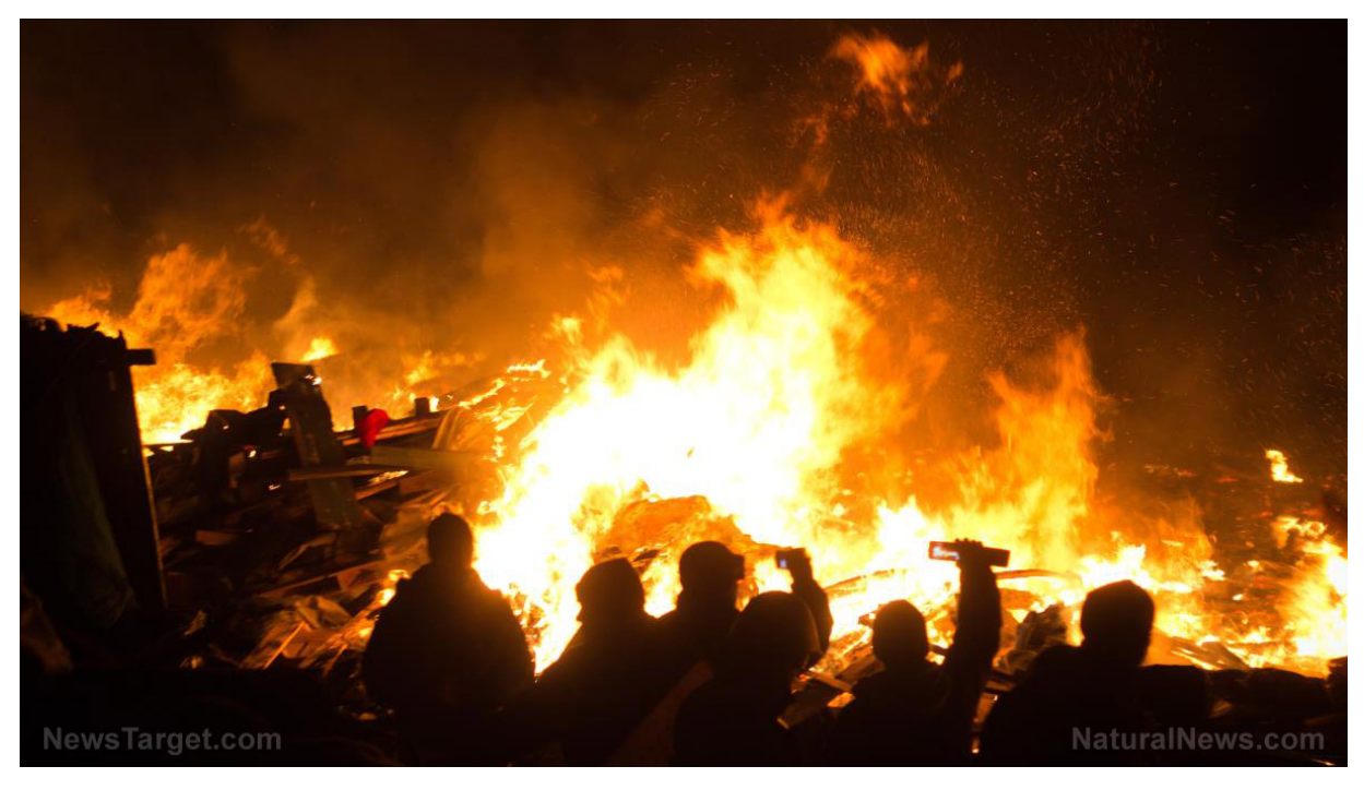
NATO calls up hundreds of thousands of troops ready to begin WWIII By victort // Share