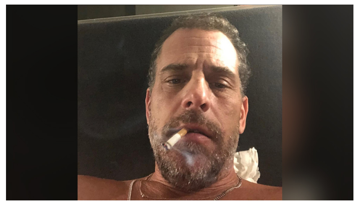
New York Times quietly admitted that they are fake news, that Hunter's laptop was real and they made up Russian disinformation