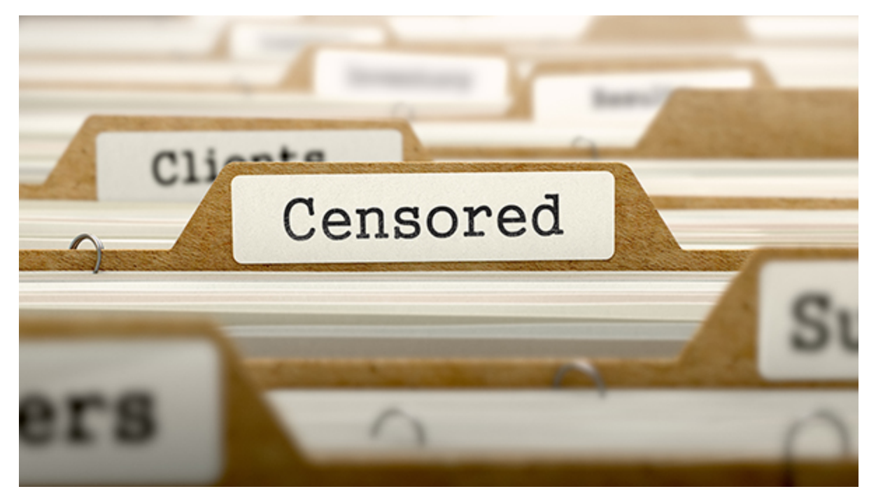
Science papers now subject to extreme censorship if they question the "official" narrative on anything: COVID, AIDS, vaccines, climate, virology and more