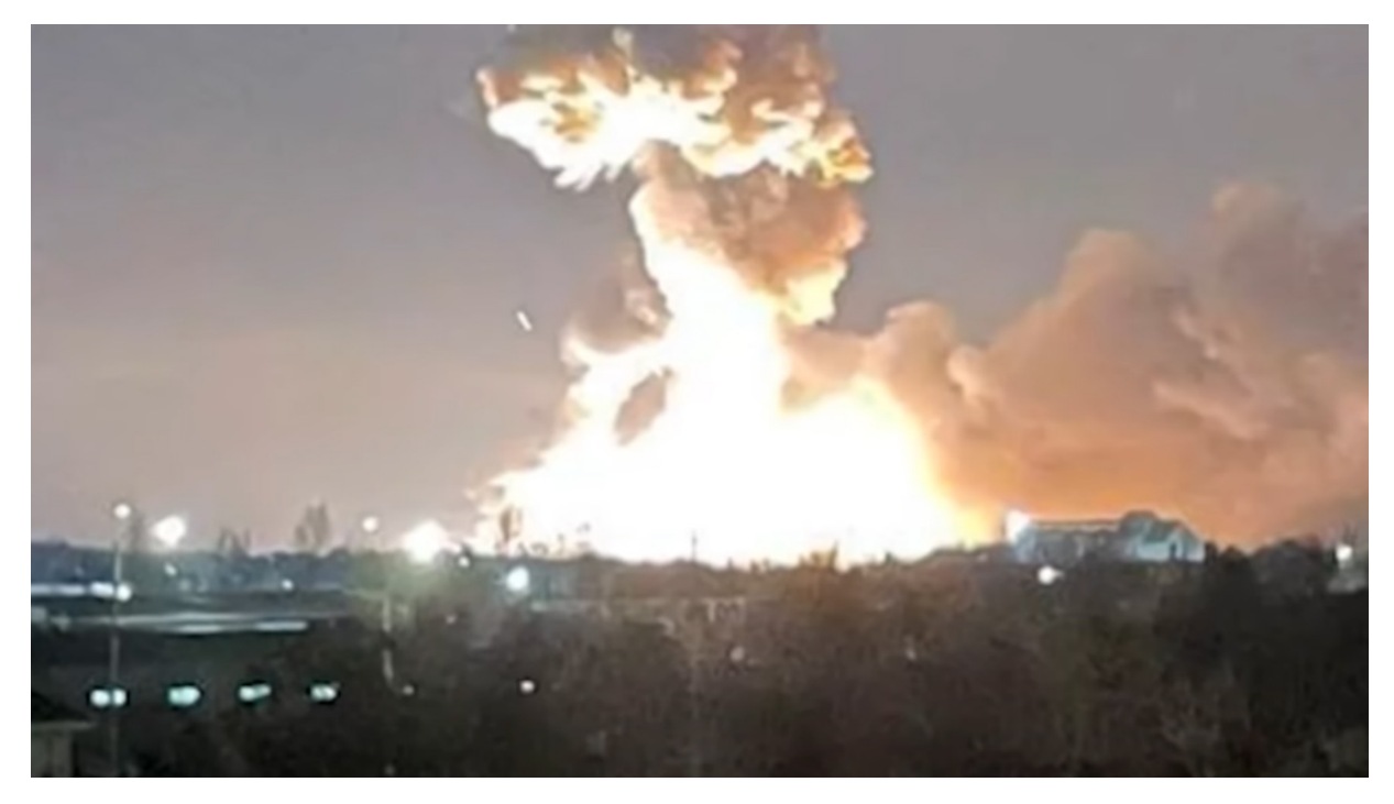
Mystery munitions being found in Ukraine finally identified; Russia has been keeping this profound capability secret