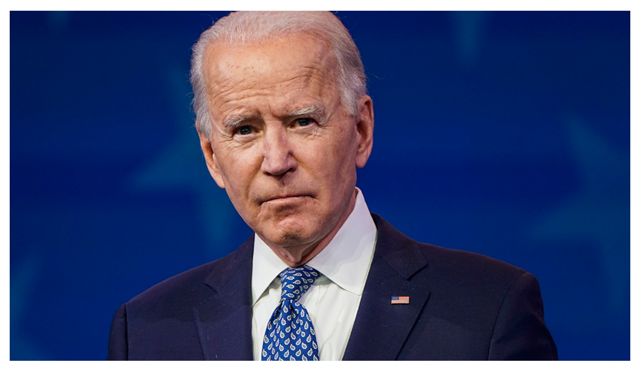
The NYT now admits the Biden laptop - falsely called "Russian Disinformation" - is authentic