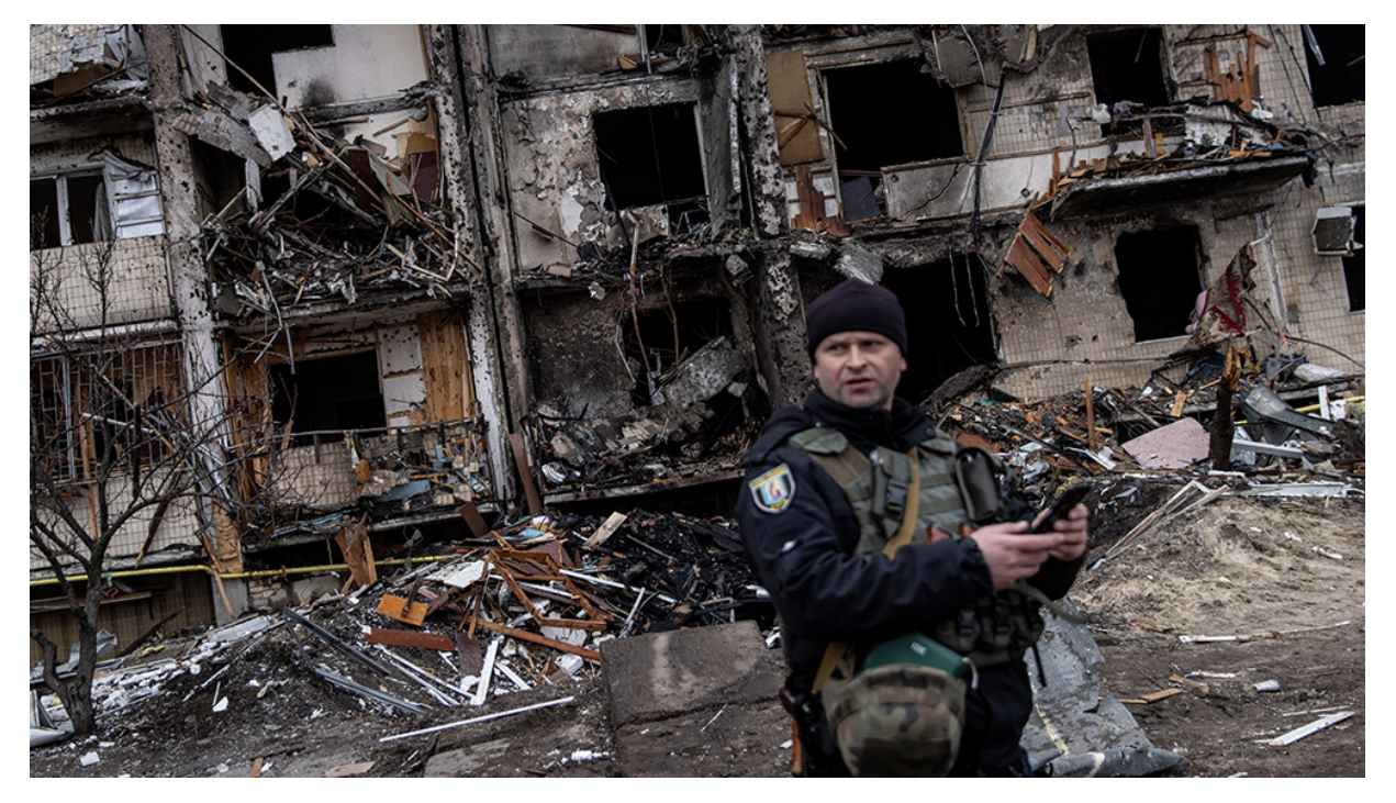
Ukraine's foreign volunteers are being told they won't be able to leave... it's a 'death warrant'