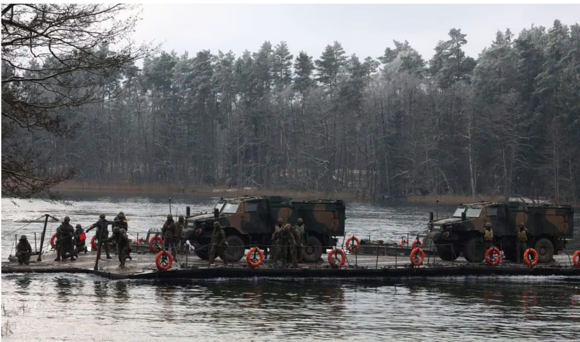
Polish military vehicles are transported during TUMAK-22 NATO exercises in an area known as the Suwalki Gap, of crucial significance to the security of the alliance's eastern flank, at a polygon in Klusy, Poland November 25, 2022.