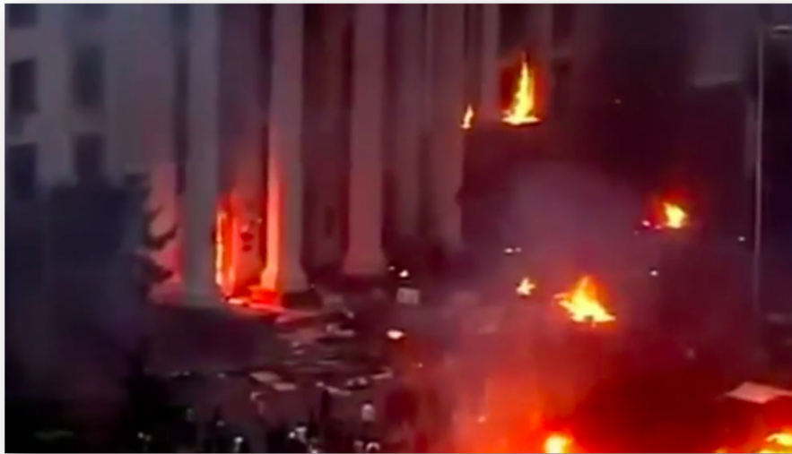
Trade Unions House - Odessa on May 2, 2014

were always part of Russia and are occupied by Russian people – not Ukrainians. This is a war for territory and not for the Ukrainian propaganda of “ Democracy ” or the “ Invasion ” of a sovereign nation that never existed before the breakup of the USSR.