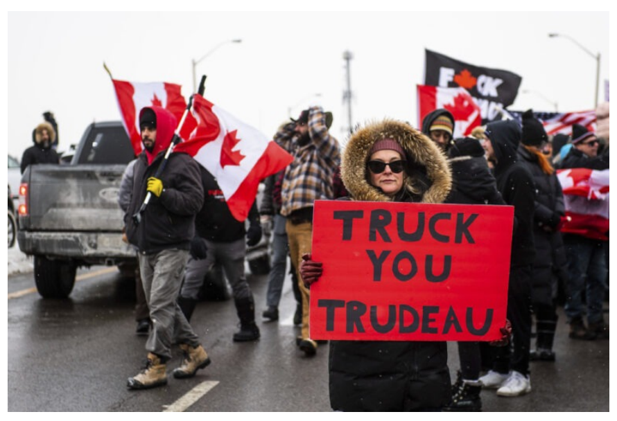
Protestors show their support for the Freedom Convoy of truck drivers who are making their way to Ottawa to protest against COVID-19 vaccine mandates by the Canadian government on Thursday, Jan. 27, 2022, in Vaughan.

Submitted by Global Freedom Movement SOTN Exclusive