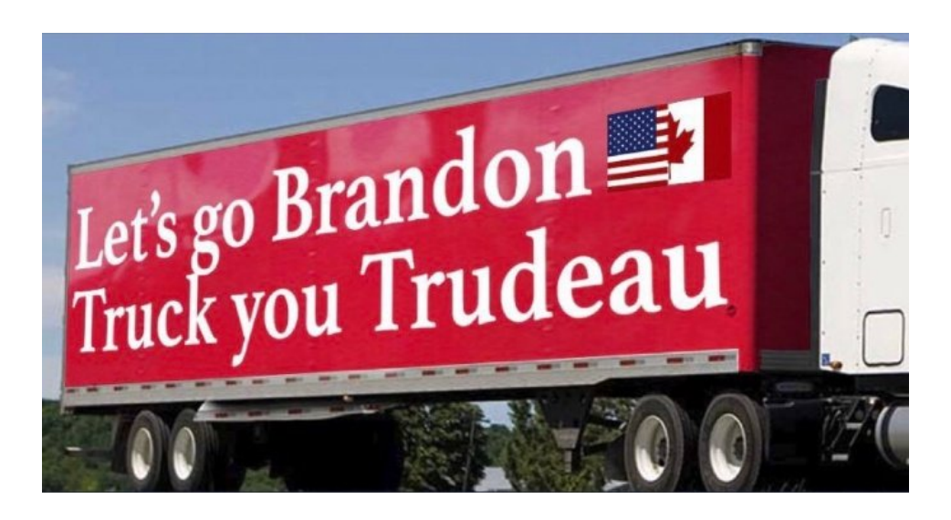
"One-Two Punch Strategy" Summarized in One Photo

As more and more Canadians wake up to the hard ugly fact that there's a stone-cold traitor living at 24 Sussex Drive, the more who are eagerly joining and/or supporting the unparalleled FREEDOM CONVOY 2022 movement.