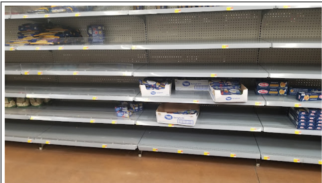
Reader Image: Walmart, ID - Pasta Shelf

The reader also sent images of a couple canned food sections where we could see empty spaces indicative of food shortages.