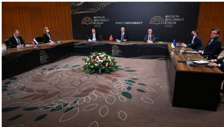
Russian Foreign Minister Sergey Lavrov and his Ukrainian counterpart, Dmytro Kuleba, holding talks in Antalya, Turkey.

Moscow’s Western partners “can’t be trusted anymore,” Foreign Minister Sergey Lavrov says