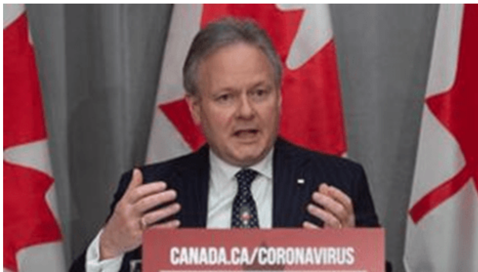
Stephen Poloz speaking in March 2020. [199]