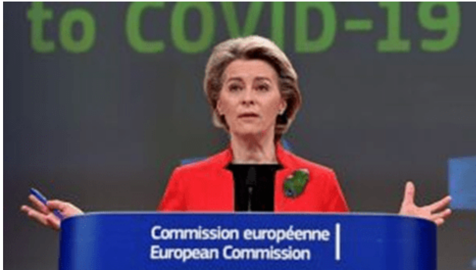
Ursula von der Leyen, a figure of great importance in the COVID-19 event.