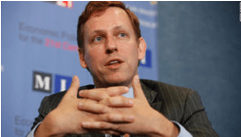
Peter Thiel, Co-founder and largest shareholder of Palantir, which is heavily involved in crunching COVID data.

Peter Thiel – 2019-2007 – Co-founder and largest shareholder of Palantir as of 2020