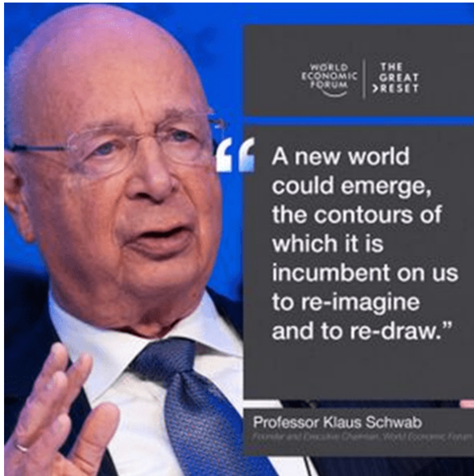
Klaus Schwab, ex-Bilderberg Steering Committee.

The Great Reset is an SDS attempt to reframe economic inequality in a positive light: “You’ll own nothing, and you’ll be happy”. COVID-19 has greatly increased economic inequality as small and medium enterprises have been forced under while unprecedented peacetime increases in the money supply and corporate welfare have been doled out to a few large organisations.