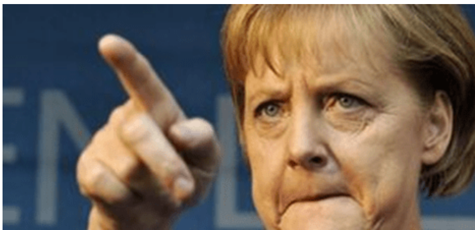
Angela Merkel as German Chancellor stated that “the pandemic is not over until all people in the world have been vaccinated.”