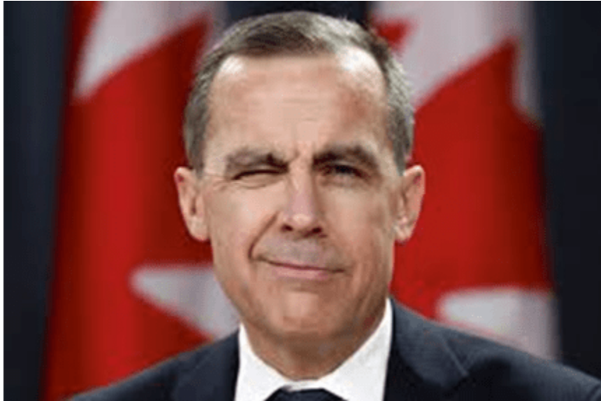
Mark Carney, Tri-national, quad-Bilderberger, Governor of the Bank of England until March 2020, when he became an “informal adviser” to Prime Minister Justin Trudeau