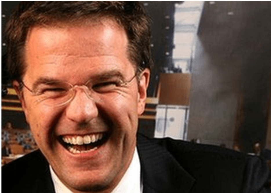
Mark Rutte, a six-time Bilderberg visitor, as Dutch PM fired his Economic Affairs Minister, Mona Keijzer, shortly after she publicly criticised the Dutch Vaccine passport. [152]

See Wikispooks’ full article: Vaccine/Passport