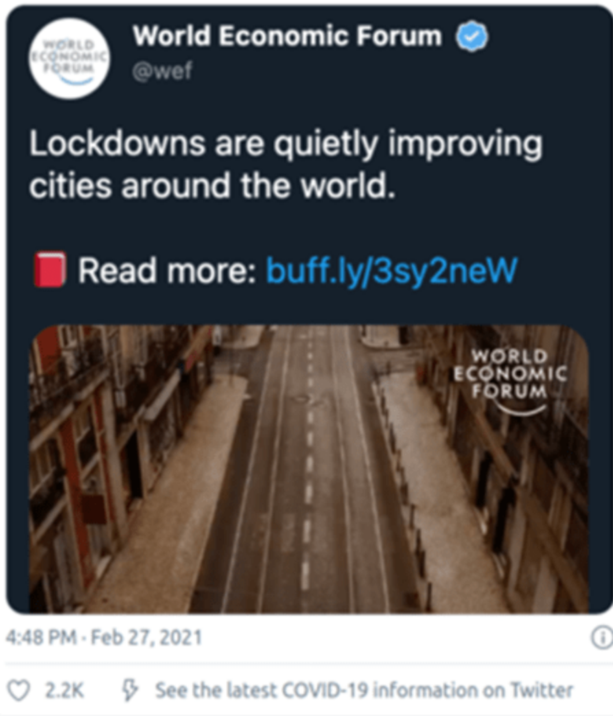
A WEF tweet which was quickly deleted after it raised criticism.

Most nation states decreed what was termed a “lockdown”, i.e., a drastic restriction of freedom of movement. This was in opposition to the 2019 WHO best practice guide for pandemics, which specifically advised against this practice. As of Summer 2021, there is little scientific evidence that these measures had any measurable impact on the spread of COVID-19, but this claim remains part of the COVID-19 official narrative.