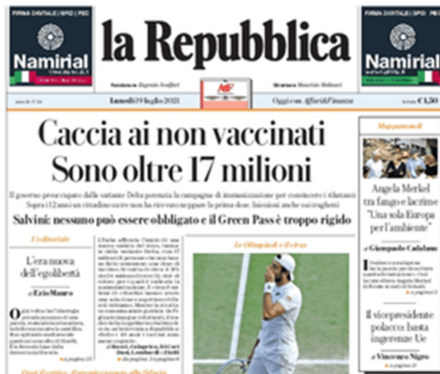
“Hunt for the non-vaccinated. There are 17 million more” on the front page of Maurizio Molinari’s Repubblica