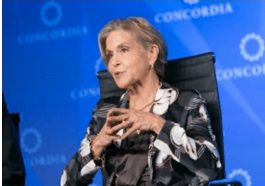
Judith Rodin took part in the 2010 Lock Step exercise about using a pandemic to usher in high-tech totalitarianism