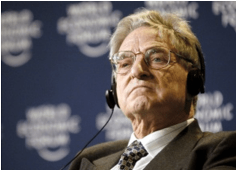
George Soros, of The Good Club, is suspected to have been controlling the narrative through groups such as BLM