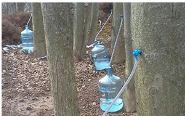
INCREDIBLE DEVICE PULLS WATER OUT OF THIN AIR

A team of Bill-Gates linked research scientists have announced they are developing a needle-less vaccine that spreads itself like a virus, meaning people will “catch” the vaccine like they would a cold or flu, without the need for needles and injections.