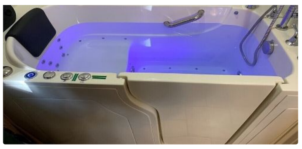
Adults Born Before 1958 Can Now Get Walk In Tubs