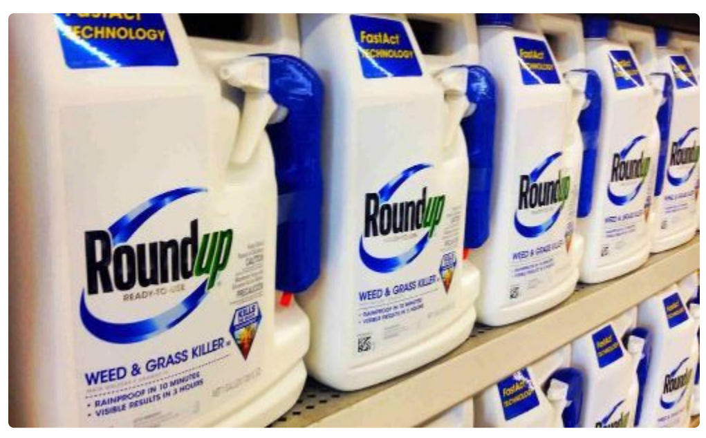
Diagnosed with Non-Hodgkin's or CLL After Spraying Roundup? By Justice Here