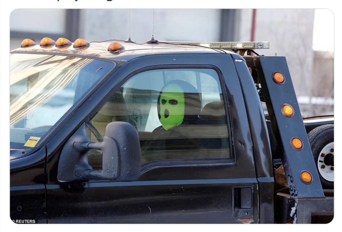
6:49 PM · Feb 18, 2022 · Twitter Web App