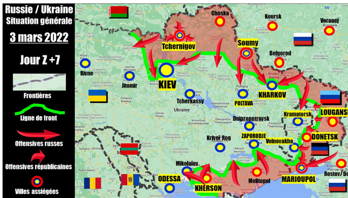
( https://alawata-rebellion.blogspot.com/ )

Below is a map of the military situation as of 3 March, courtesy of Erwan Castel