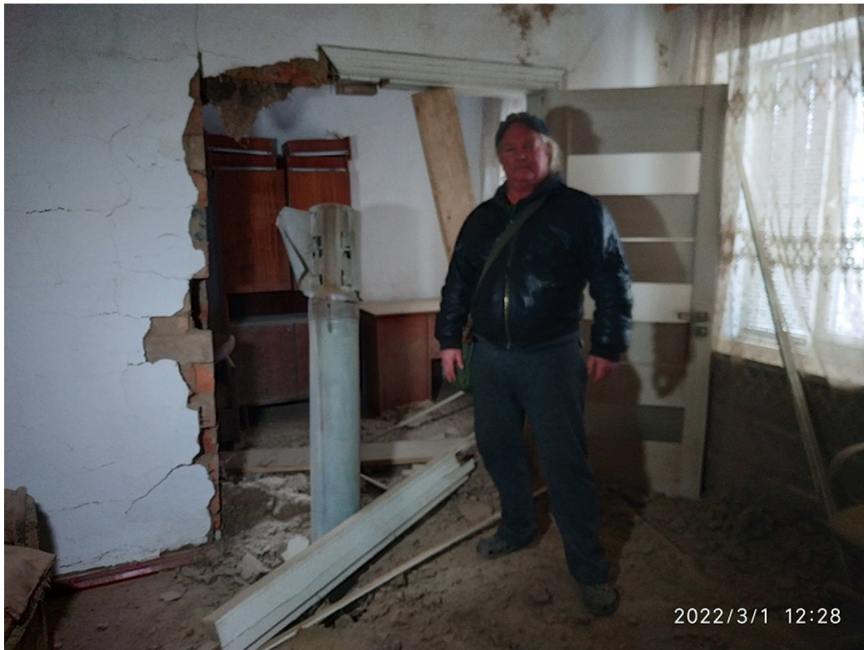
(Unexploded GRAD missile inside civilian house in the village of Andon)

The Russian liberation forces are huge - multi-hundreds of tanks and armored infantry vehicles, very tough and ready soldiers, led by highly competent officers. The DPR Republican forces are still holding the line along the central Donetsk Front - Donetsk, Makeevka, Yasynuvata, Gorlovka. There are still extremely large and dangerous concentrations of ukrop soldiers on the Front, and while they have been mostly quiet and have not advanced, they are still shelling civilian areas of all our cities daily. One of the major ukrop strongpoints is the Mari'inka area, barely 5 miles from my house in Petrovsky District of Donetsk. There is also a high concentration of nazis and war criminals there, and it will not be taken without a hard fight. Nothing in this war will come easy.