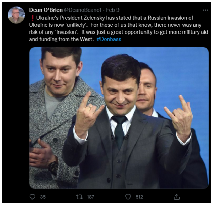
"Those of us that know" didn't know shit, but were happy to insult me, the one who got it right.