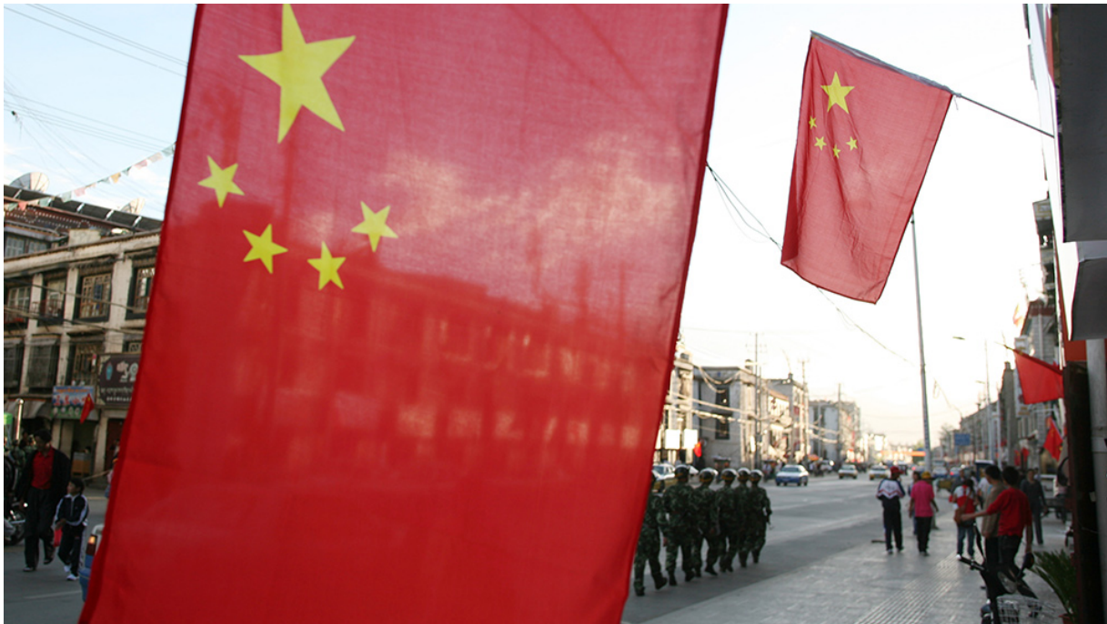
The next plandemic? China's People's Liberation Army launches hemorrhagic fever viral attack during Olympics