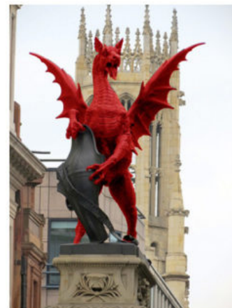
City of London statue

Khazarian Kingpins always hold their timeless, inter-generational grudge.