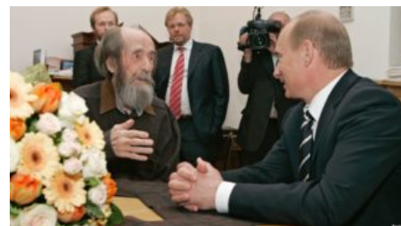
Alexander Solzhenitsyn with Vladimir Putin

The current King and his court were warned by his spies, and the top Khazarian nobility was able to flee with their great wealth of silver and gold before the invasion and destruction of Khazaria.