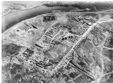
The site of the Khazar fortress at Sarkel, sacked by Sviatoslav c. 965 (aerial photo from excavations conducted by Mikhail Artamonov in the 1930s)

The Russian and Persian leaders had had enough, in about 750 AD – Khazaria's King Bulan was given an ultimatum jointly by both Russia and Persia that he had to select one of the three Abrahamic religions to "clean up" the Khazarian People.