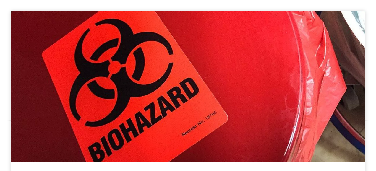
Who Are the Americans Coordinating Bioweapons

The goals of these projects included research on the plague virus, tularemia, the bird flu and African swine fever.