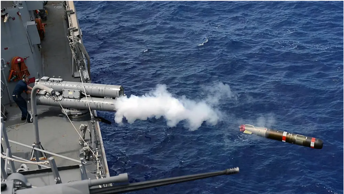
A U.S. sailor aboard the guided missile destroyer USS Mustin (DDG 89) fires a torpedo at a simulated target during Valiant Shield 2014 in the Pacific Ocean September 18, 2014.