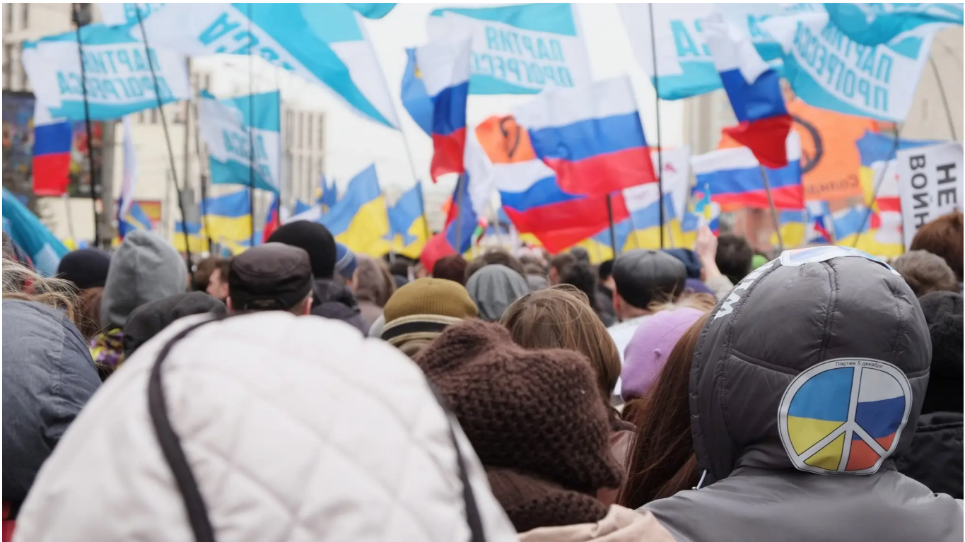
Muscovites protesting the war in Ukraine and Russia's support of separatism in the Crimea on the Circular Boulevards in Moscow on March 15, 2014.