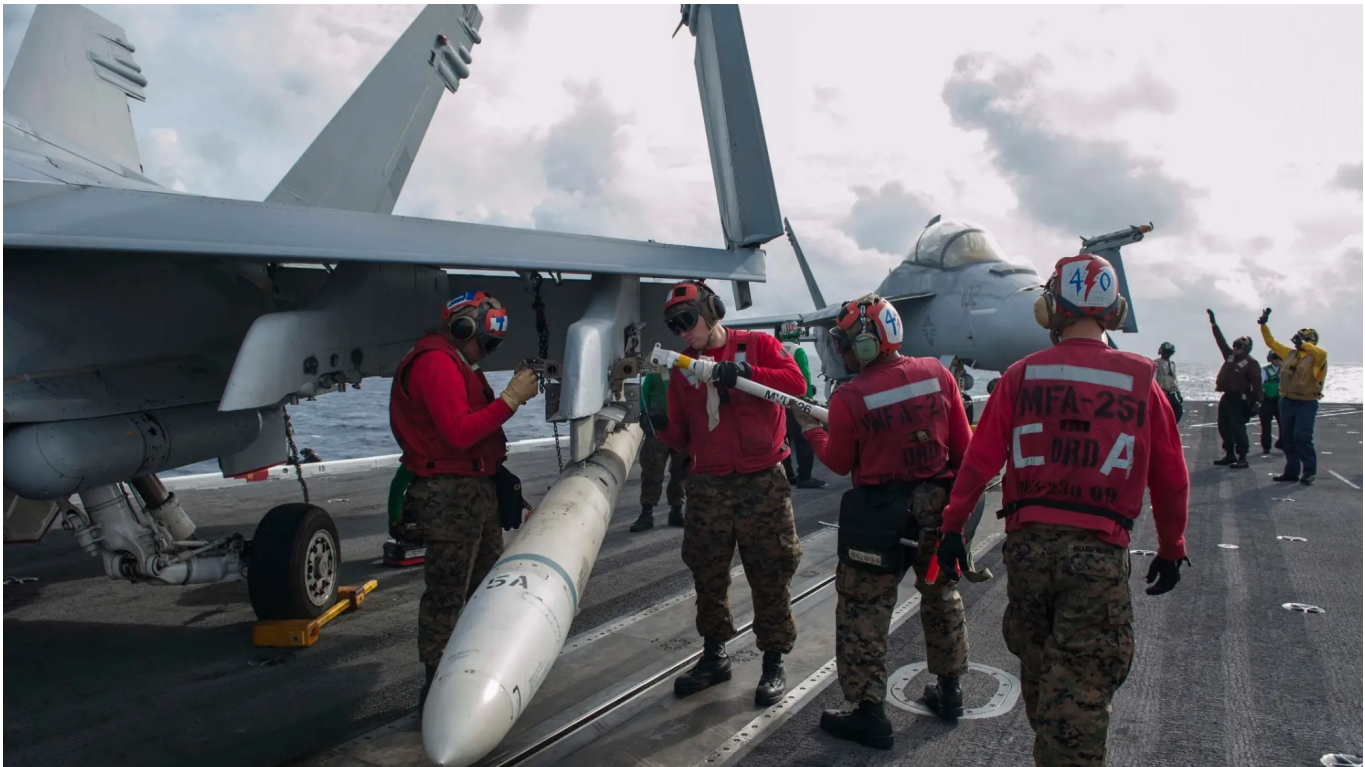
Marines assigned to the Thunderbolts of Marine Fighter Attack Squadron (VMFA) 251 remove a training AGM-88 HARM from an F/A-18C Hornet on the flight deck of the Nimitz -class aircraft carrier USS Theodore Roosevelt (CVN 71).