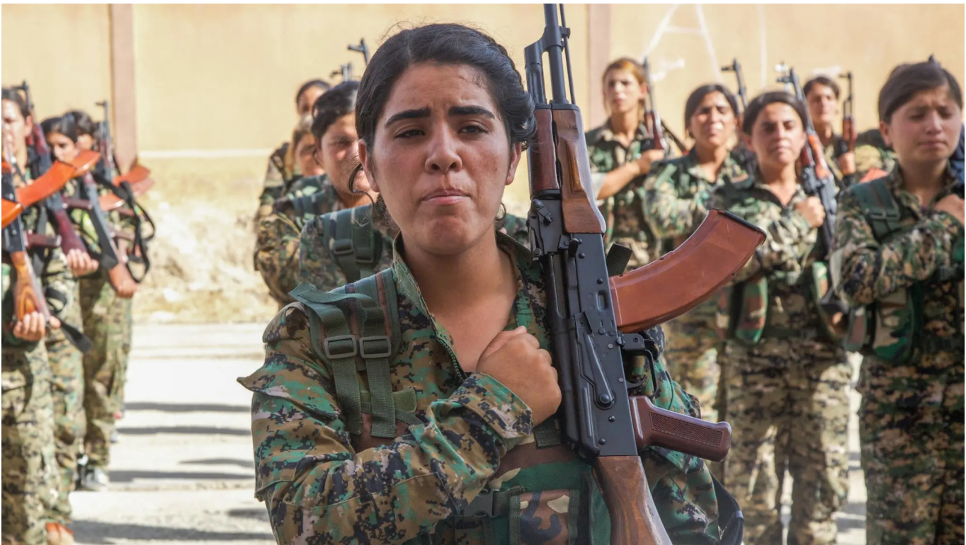
Syrian Democratic Forces trainees, representing an equal number of Arab and Kurdish volunteers, stand in formation at their graduation ceremony in northern Syria, August 9, 2017.