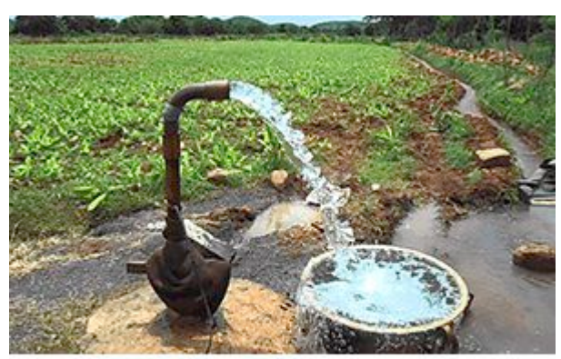
OFF-GRID DEVICE CAN PRODUCE WATER-ON-DEMAND

rock 'n' roll legend Elvis Presley, has died following a sudden cardiac arrest. The fully jabbed singer/songerwriter was 54.