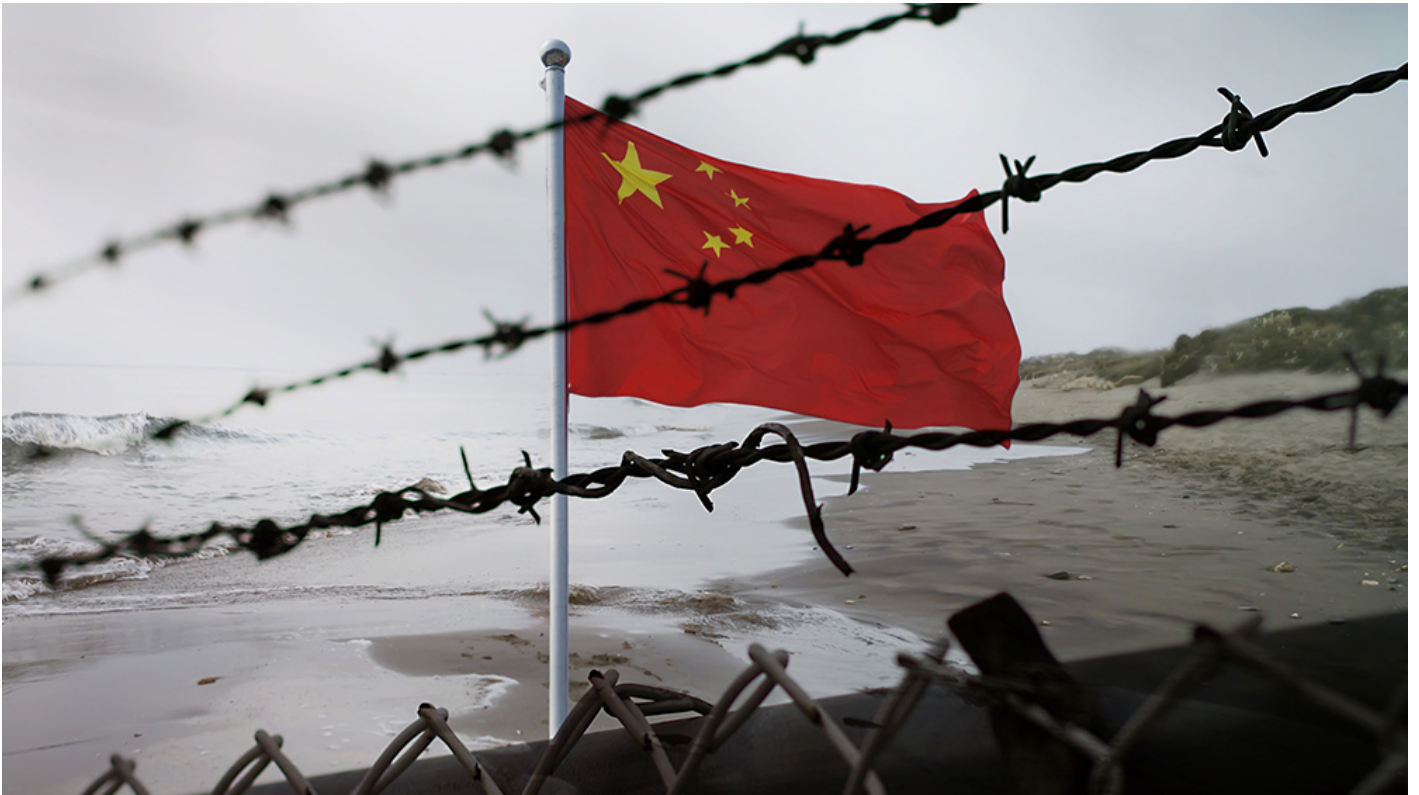
Shanghai descends into hellscape as COVID lockdown triggers martial law, arrests and suicides