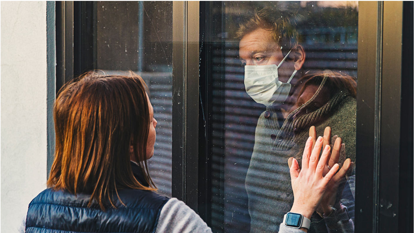
Study finds unvaccinated people are healthier than the vaccinated