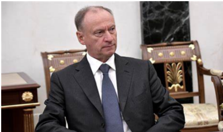
Meeting with permanent members of the Security Council...

When asked directly if he believed the Americans are developing biological weapons there, Patrushev said: “We have good reason to believe that this is exactly the case.”